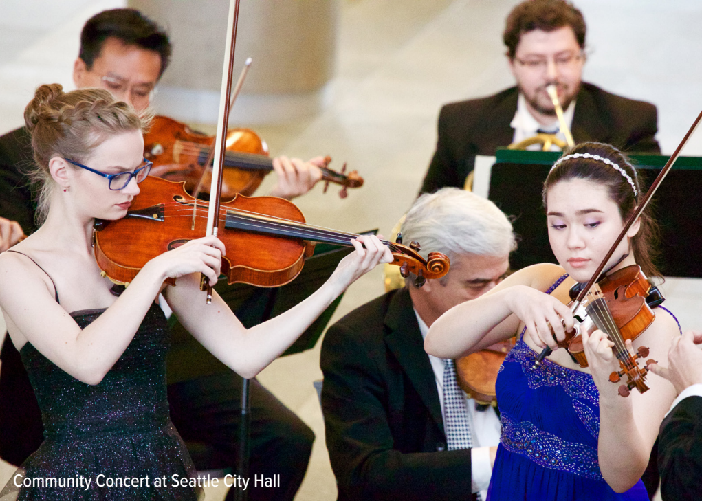
Community Concert at Seattle City Hall