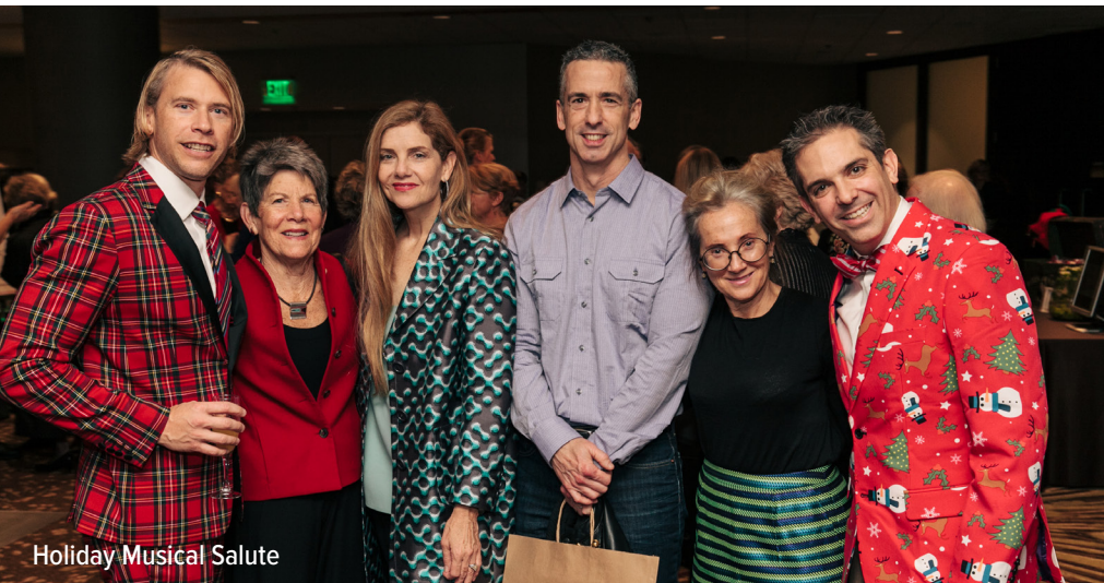
Holiday Musical Salute