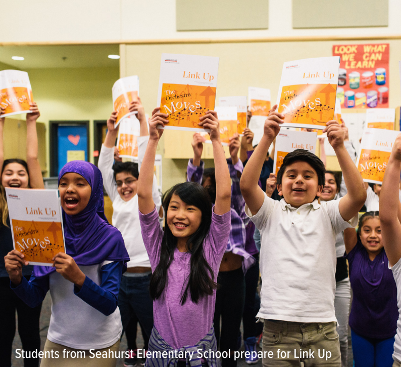
Students from Seahurst Elementary School prepare for Link Up