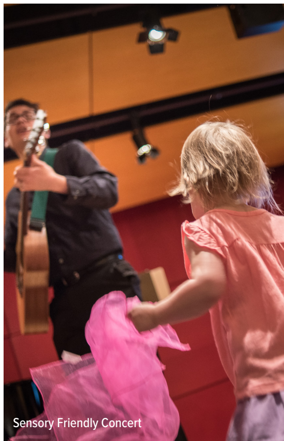
Sensory Friendly Concert