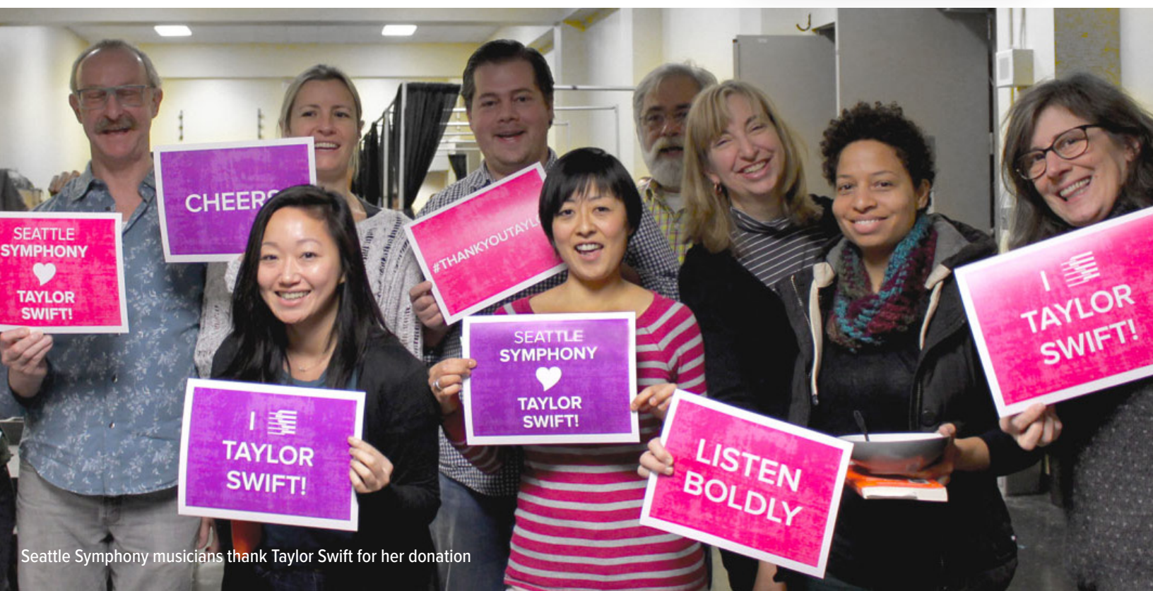
Seattle Symphony musicians thank Taylor Swift for her donation