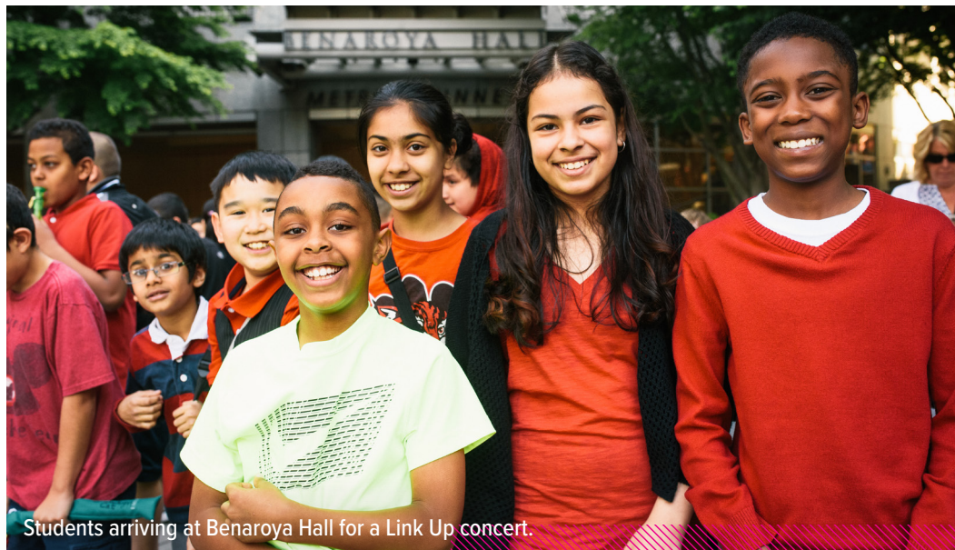
Students arriving at Benaroya Hall for a Link Up concert.